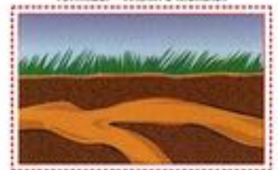
100% Control! NO MORE termites to damage your home. The Termidor is still in the soil around your home providing protection against any new invading termite colonies.