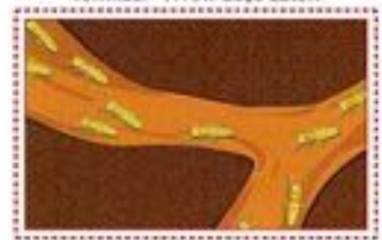
Termidor has been transferred to many in the colony. Many have already died, but the 'transfer effect' continues to kill those who have not even gone into the treated zone.